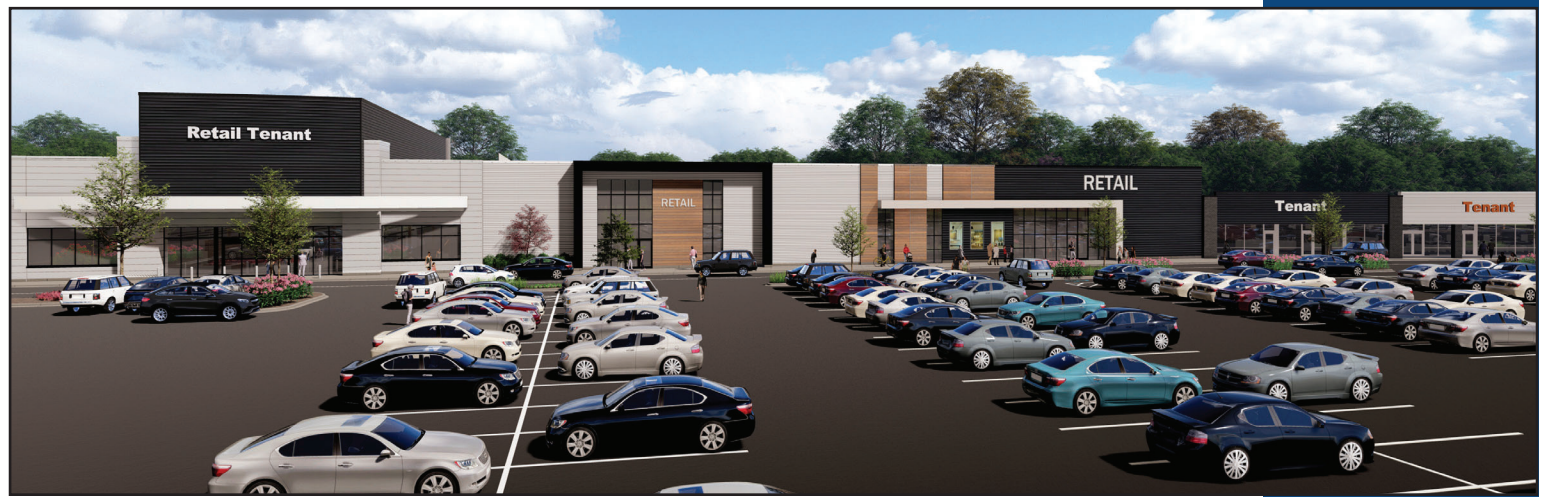
Rendering of 2024 Renovation (Camburas Theodore LTD)